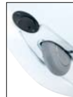
Optional Integral Wheel no need for a trolley!