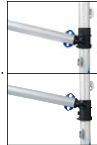
Two Position Gooseneck makes switch between the Standard and Race rig a snap