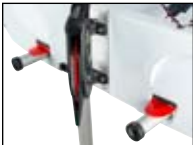
Optional Integral Carry Handles when purchased with wheel option