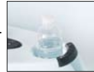
Integrated Water Bottle Holder