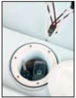
Secure Storage Port