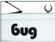
Oars and Oarlocks store within the hull